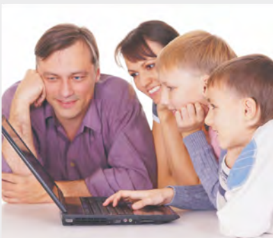
Quick & Easy Setup