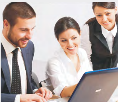
Enhanced Multimedia Experience