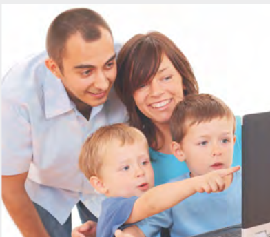
User friendly utility